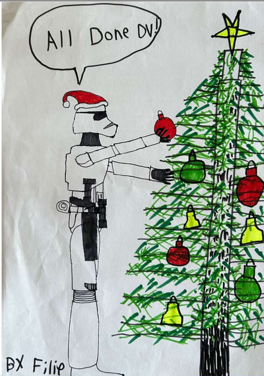
- Filip, Grade 5