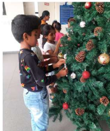
- Ain, Grade 7