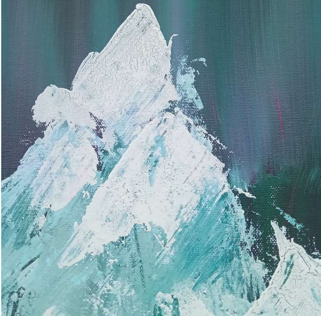
- Uttara, Grade 5