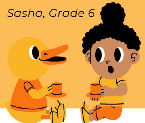
- Sasha, Grade 6

Want to be featured in our next issue? Write to us at tcd@cochins.org