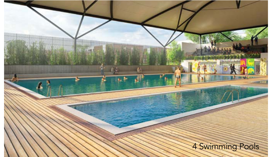
4 Swimming Pools