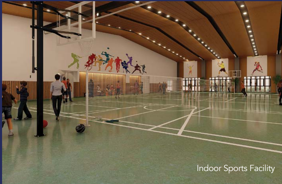
Indoor Sports Facility